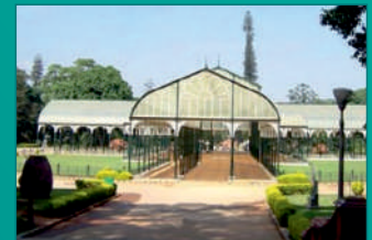
Lalbagh Botanical Garden